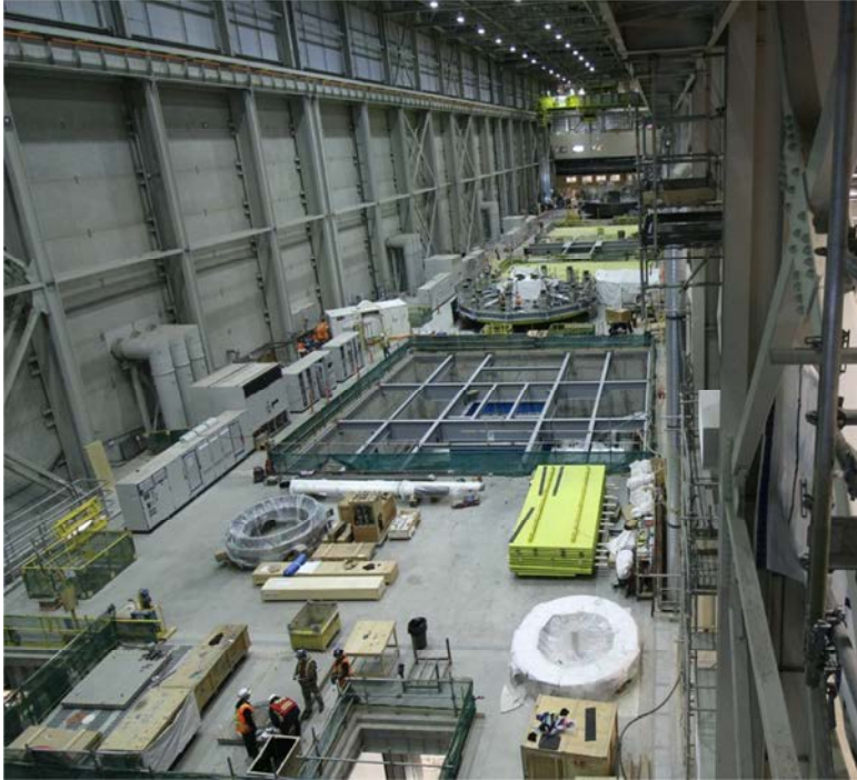
Inside the Muskrat Falls Powerhouse looking south (Unit #4 to Unit #1)