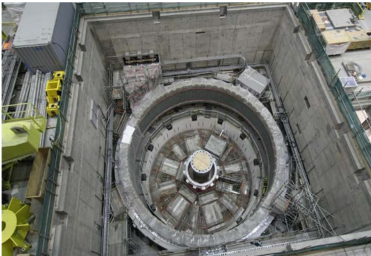
Overlooking Unit #4 in the Muskrat Falls Powerhouse