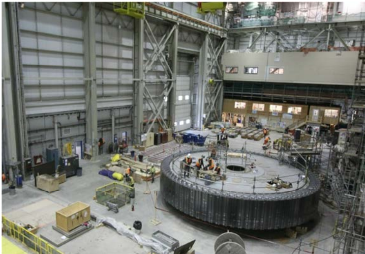
Inside the Muskrat Falls Powerhouse – view of work in the South Service Bay

The Unit 4 rotor pole installation is underway. Completion of Unit 4 commissioning and Ready for Operation is forecast for September 2021.