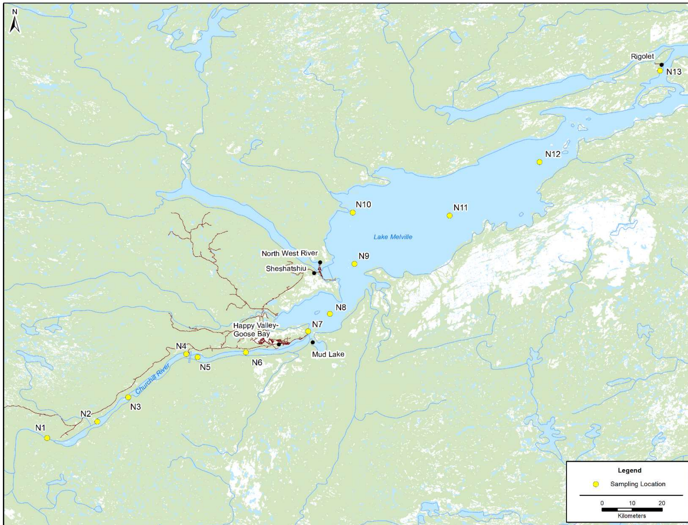
Figure 1: Map of sampling locations for the Muskrat Falls Methylmercury Monitoring Program

133 Crosbie Road PO Box 13216 St. John's, NL A1B 4A5 Tel +1 709 722 7023 woodplc.com