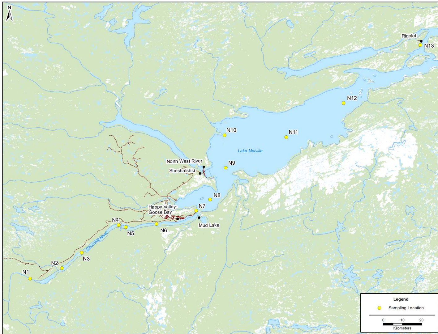
Figure 1: Map of sampling locations for the Muskrat Falls Methylmercury Monitoring Program

133 Crosbie Road PO Box 13216 St. John's, NL A1B 4A5 Tel +1 709 722 7023 woodplc.com