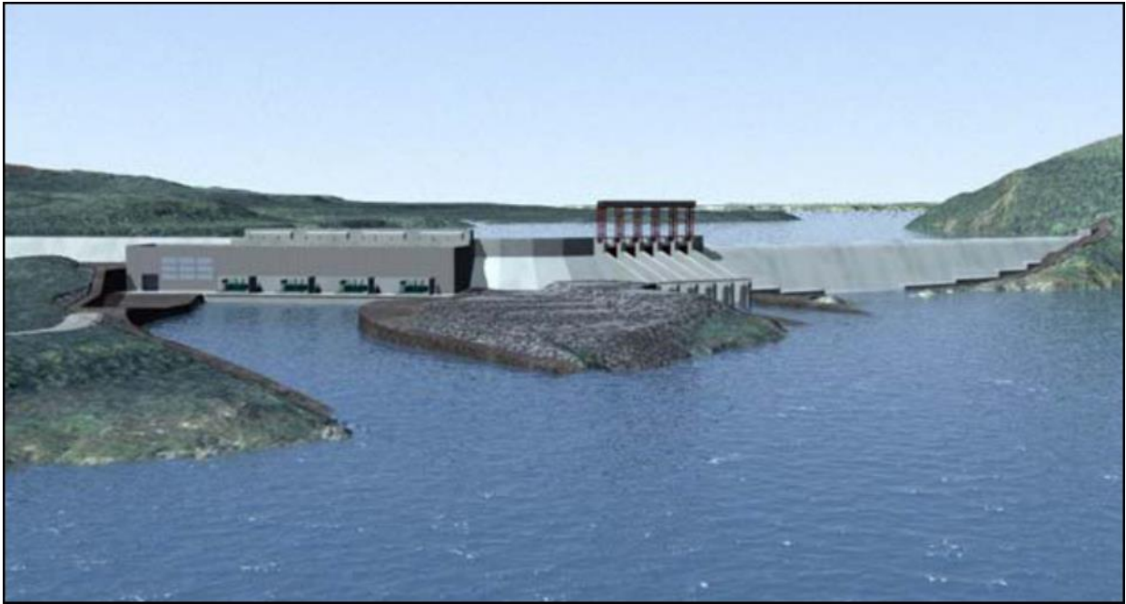
Figure 5-1 Muskrat Falls Generating Facility