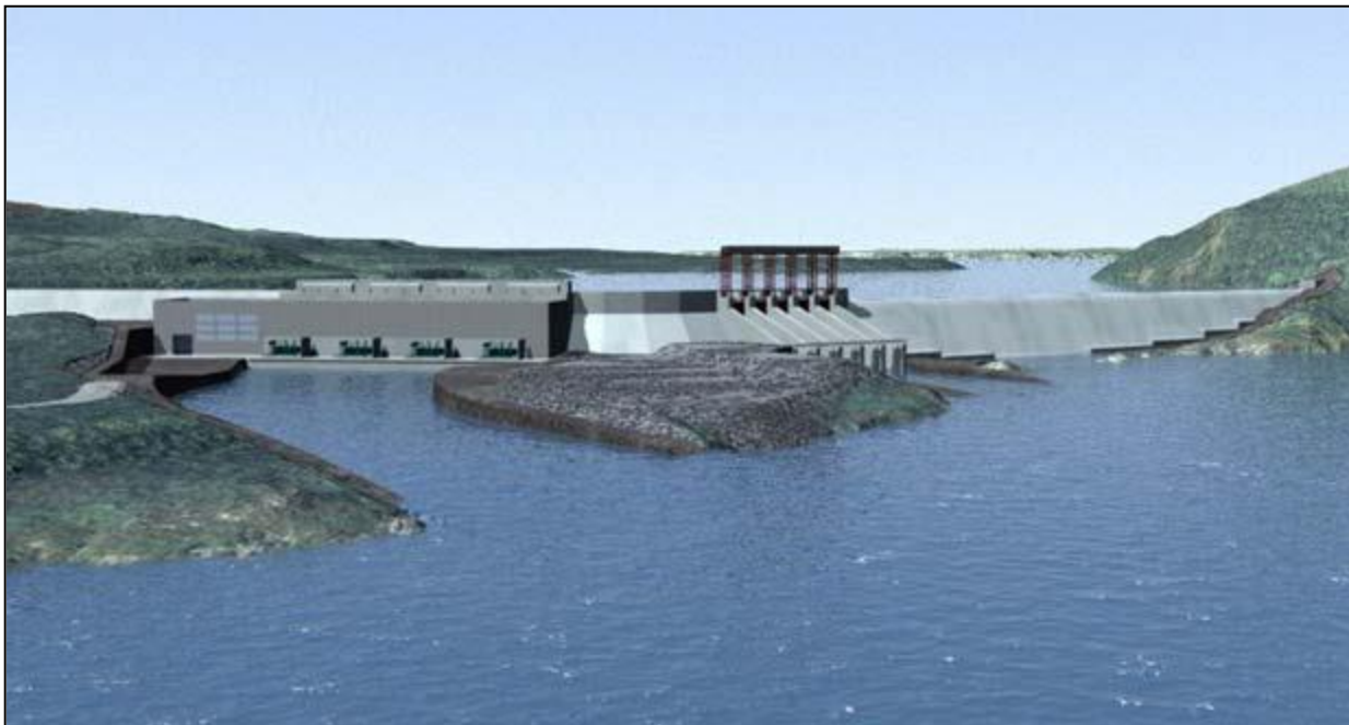
Figure 6-1 Muskrat Falls Generating Facility